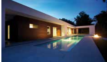
Lake House | Miami, FL