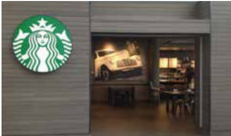
Coffee Shop | Brooklyn, NY

All its very exceptional properties make Resysta extremely resistant to weather influences like sun, rain, snow and ice, salt- and chlorine-water. Resysta does not swell, crack, splinter or rot. We provide a limited warranty up to 25 years in residential applications and up to 15 years for commercial.