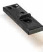
RESCLIPHF100 FACADE Clip