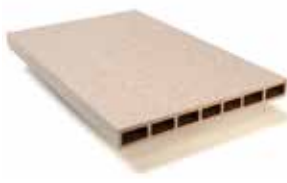
RESP340812 7CH Cladding (W x H x L) 3/4" x 7 3/4" x 12'