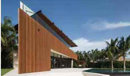
Private | Florida