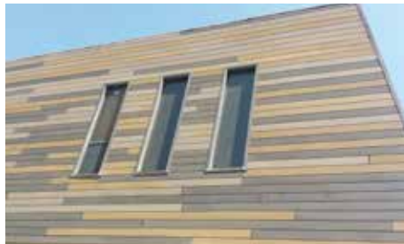
Office Complex | Monterey Park