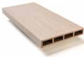
RESP340612 4CH Cladding (W x H x L) 3/4" x 5 1/2" x 12'