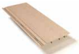
RESCP120412 4" Siding (W x H x L) 1/2" x 4" x 12'