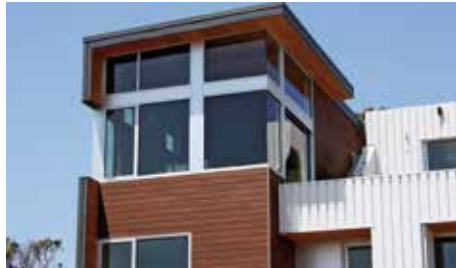
Private Residence | San Diego