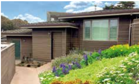
Country Club | Manhattan Beach